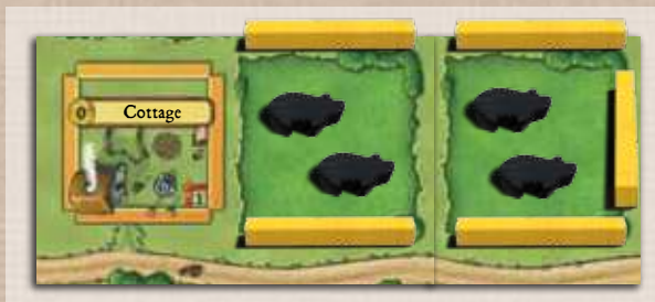
In this pasture, there is room for up to 4 animals of the same type.

You use the borders to enclose your pastures. Each fully enclosed pasture can hold up to 2 animals per space. Each pasture can only hold a single animal type.