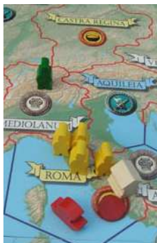
Movement action Battle