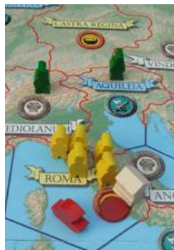
Movement action No battle