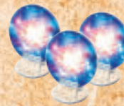
6 Mystic Barriers and Plastic Stands