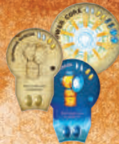
20 Cosmic Gate Component Tiles and 1 Power Core Tile