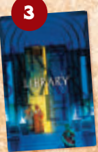
3 Library deck