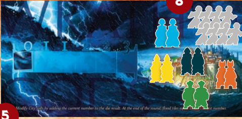
5 Wrath of the Gods track