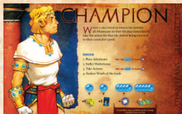
10 Councilor Player Boards

Each of the councilors of Atlantis has a different councilor ability, explained at the top of a player's councilor board.