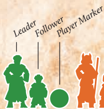
1 Leader, 4 Followers, 1 Player Marker in green, orange, purple, & navy