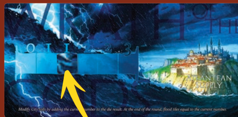
THE WRATH TOKEN tracks the current level of the Wrath of the Gods track.

If the players cannot agree on which tile(s) to flood, the starting player chooses. Then, the starting player moves the Wrath counter up one level. If the wrath counter is already in the final space of the track, it does not move.