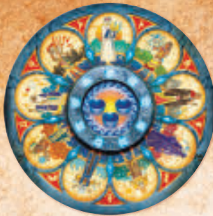
1 Cosmic Gate Board