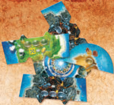
37 Island Board Tiles