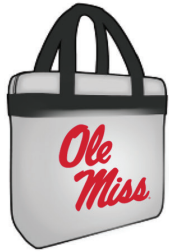
12" X 6" X 12" CLEAR PLASTIC BAG