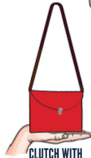
CLUTCH WITH SHOULDER STRAP NO LARGER THAN 4.5" X 6.5"