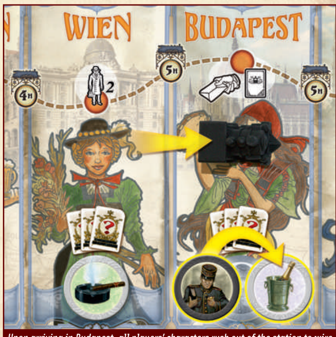
Upon arriving in Budapest, all players' characters rush out of the station to wire a telegram before sharing some of their knowledge with their fellow passengers... The Conductor moves to the Lounge car for a well-deserved drink.

Conductor accordingly to the new Car indicated on its token, in preparation for the next leg of the trip.