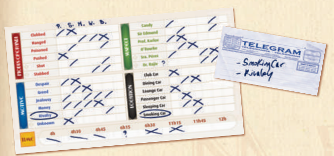
The Mystery Express is about to leave Budapest... some players have already wired in their first suspicions.

Should several players be tied for the highest number of Crime elements correctly identified, the telegrams each player sent from Budapest will be used to break the tie (see An Important Telegram and End Game on p. 5).