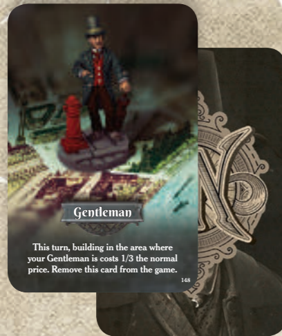
Agent card example

During game setup, before players place their pieces on the board, shuffle the Agent cards and deal 3 cards to each player 8A . Put the remaining Agent cards (if any) back into box without revealing them. Then shuffle the Building cards and deal 1 card to each player 8B . Set aside the remaining Building cards without revealing them 8C . You must now wisely choose your Agents to be placed on the board during setup.