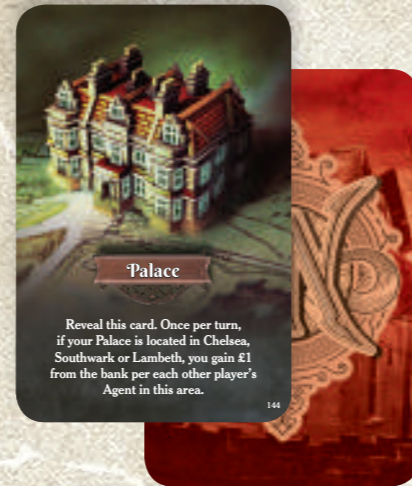
Building card example

Keep your cards secret until you play them. You can use their abilities at any time during your turn (like City Area card abilities). Some cards are single-use Actions, some have an ongoing effect, and some are Interrupts. Each card has a detailed description of its ability.