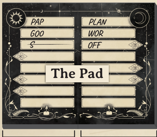
Sun team's side Moon team's side

Add more Mediums to each team. Mediums on a team share their hand of cards, work together, and can pass secret notes. Any of them can call “ Silencio .”