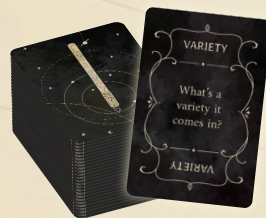
102 Question Cards