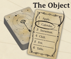
52 Object Cards