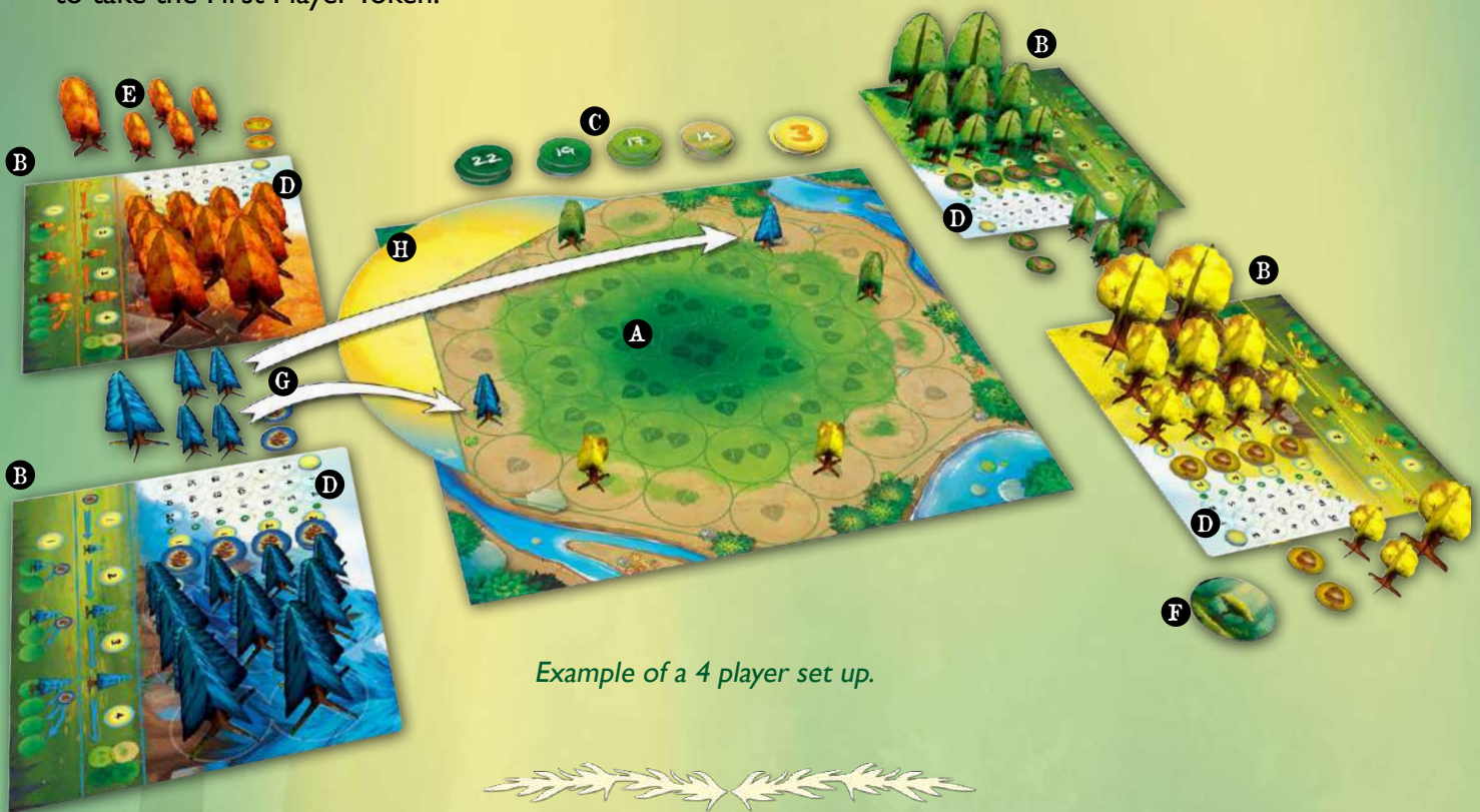
Example of a 4 player set up.

2 player game: Leave the 3 darkest green Scoring Tokens that have 4 leaves printed on them in the box, they will not be used. When players collect Scoring Tokens from the middle 4 leaf space, they instead take the tokens from the 3 leaf stack.