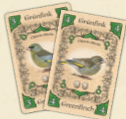
Not a pair