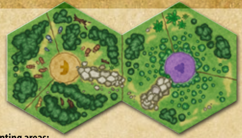
2 hunting areas: bear (left) and berries (right), both with 3 adjacent spaces.

Note: we know that players cannot hunt berries and that fish, bears, and mammoths rarely lie on harvest spaces. But to simplify the game terms, we use consistent terms for »hunting«, »hunting areas« and »harvest« or »harvest spaces«.