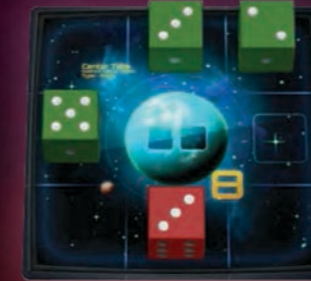
The green player CAN construct on this planet because the green dice in orbital positions (5 & 3) add up exactly to 8. The enemy red 3 and the green 2 in the corner do not affect the action.