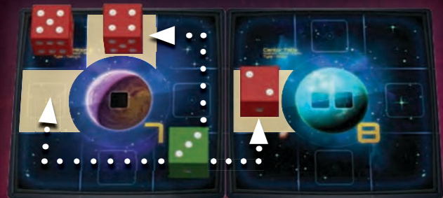
MOVING TO ATTACK POSITION: The green 3 can use its 3 movement to attack the 4 or the 2 but the 5 is out of reach.