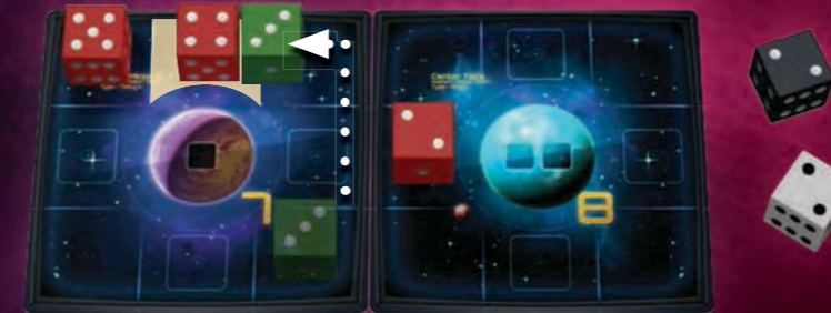
The green 3 attacks the red 4. Both players roll combat dice and get 2s. The attacker has a lower total and wins the combat.

The attacker is NOT destroyed, but simply moves back into the square from which it attacked. No dominance is gained or lost. There is no risk to the attacker should an attack be unsuccessful.