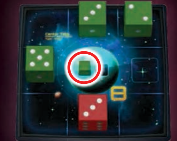
The green player uses two actions and places a quantum cube on the planet. The green player cannot build another quantum cube on the same planet because there is already a green cube there.