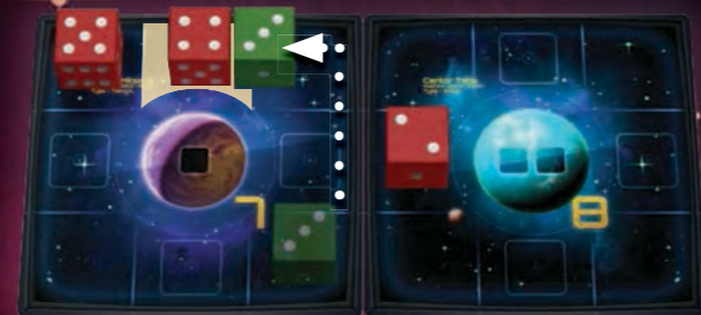
The 3 decides to attack the 4 and is placed halfway into the 4's square.