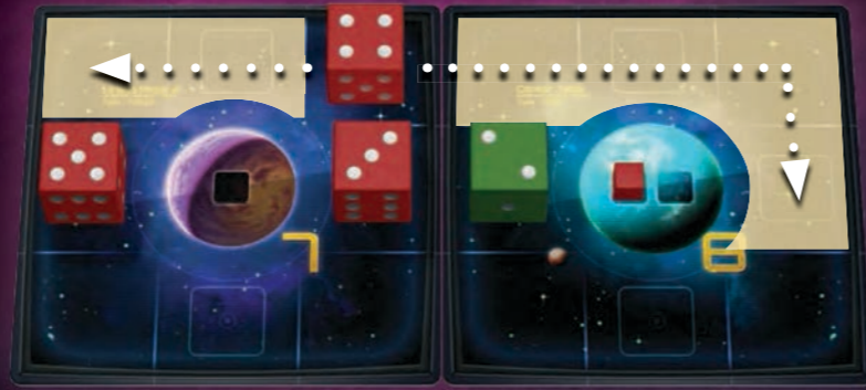
MOVING: The red 4 can move to any of the highlighted spaces. Other spaces are blocked by planets and by friendly and enemy ships.