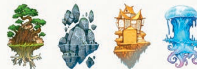
Floating Production Island: Wood/Stone/Wheat/Water