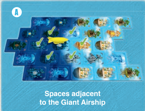
Spaces adjacent to the Giant Airship

Important: You can never keep more than 8 resources. If you ever have more than 8, you must immediately discard resources of your choice until you have only 8.