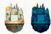
Floating City: Day/Night