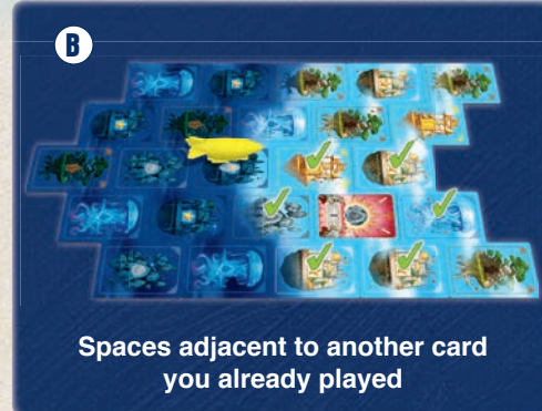
Spaces adjacent to another card you already played