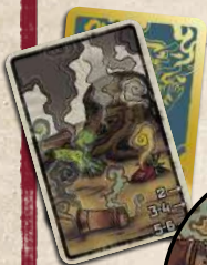
World's End card