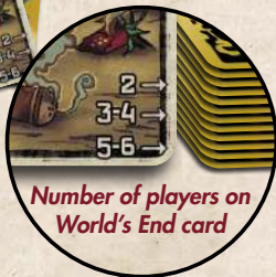
Number of players on World's End card