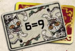
SPICE IT UP! cards