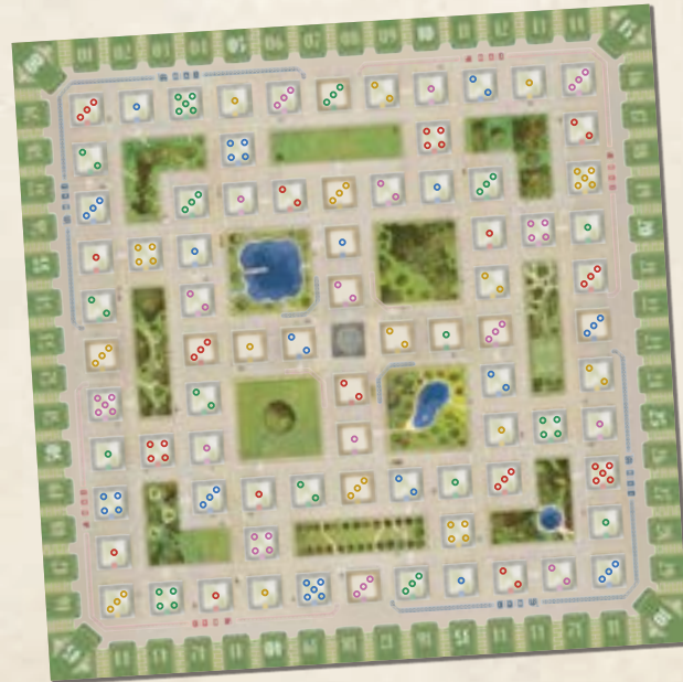
1 game board

Even behind the appearance of the most serene and romantic residential neighborhood lies fierce competition between construction companies to build it! Grab the most prestigious plots of land and build beautiful houses, but don't forget the requirements of the town plan to accumulate bonus points and claim victory!