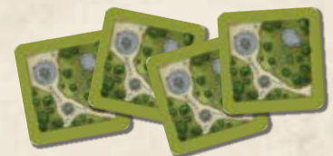
20 Park tokens