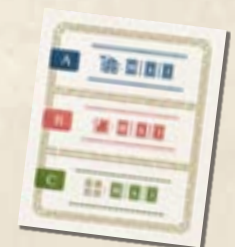
1 Reference tile