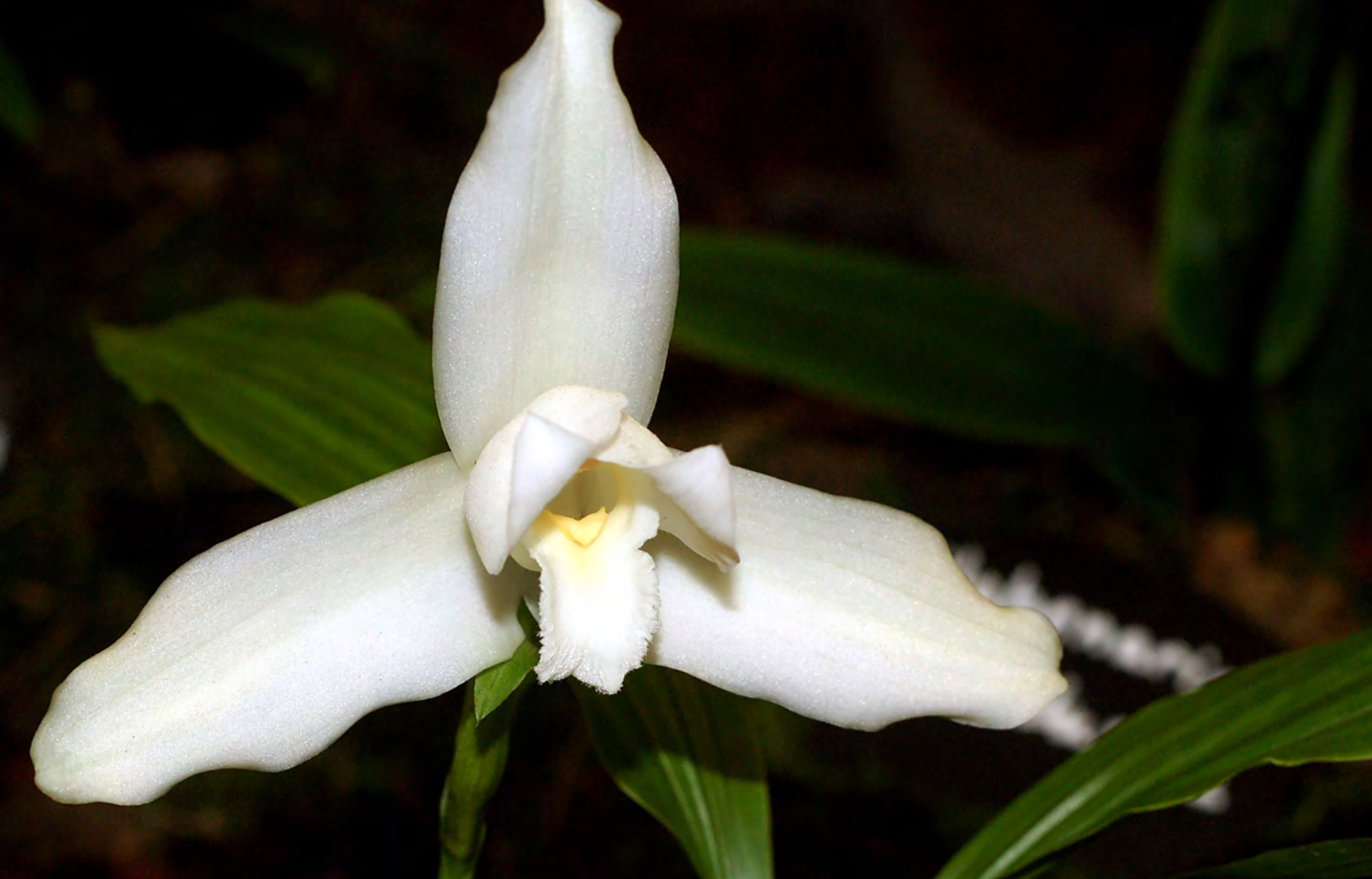
White nun orchid