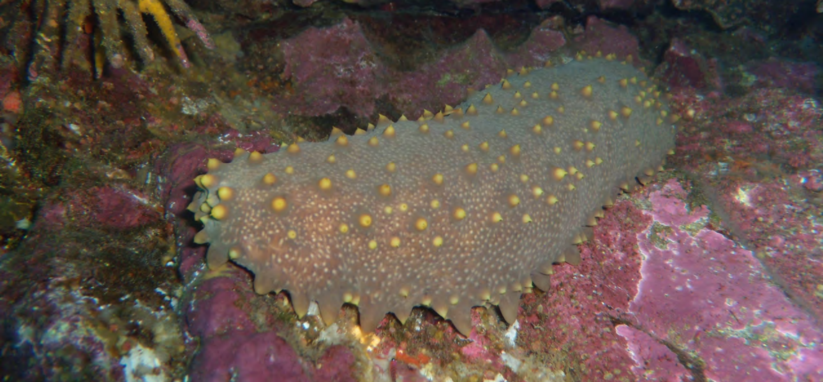
Brown sea cucumber