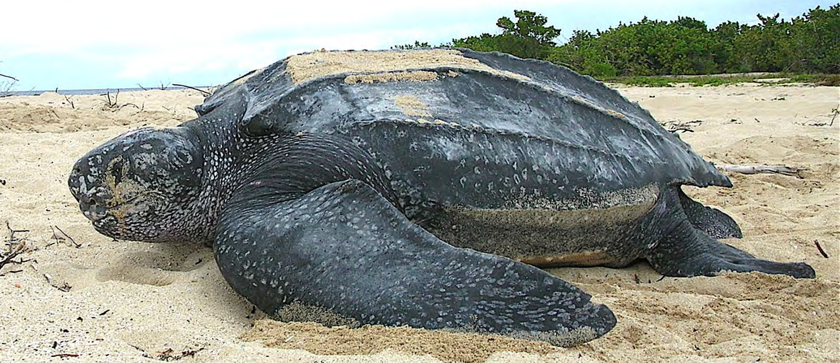
Leatherback sea turtle