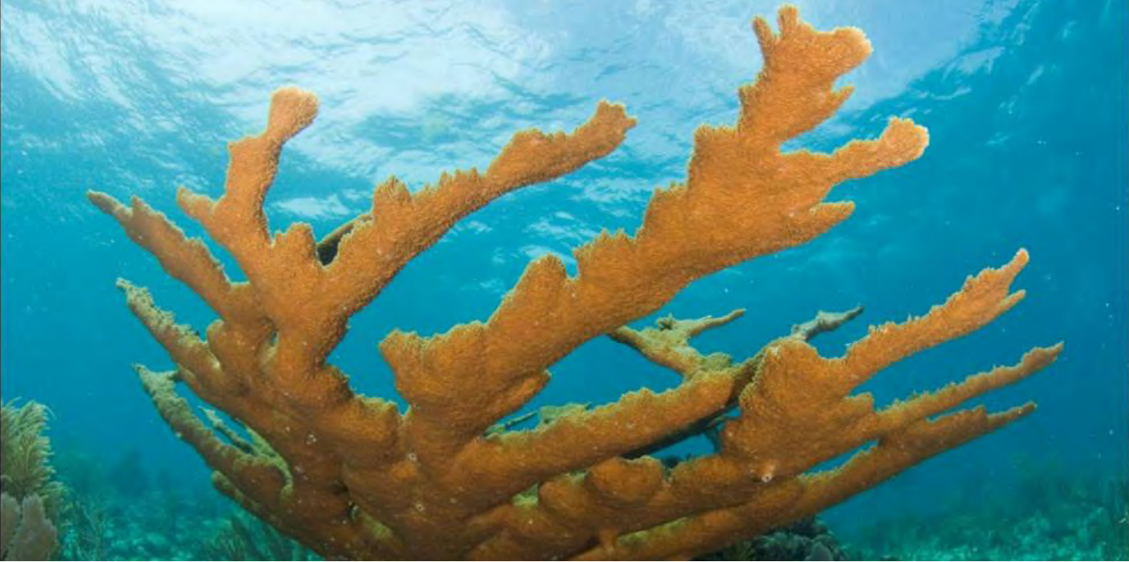
Elkhorn coral