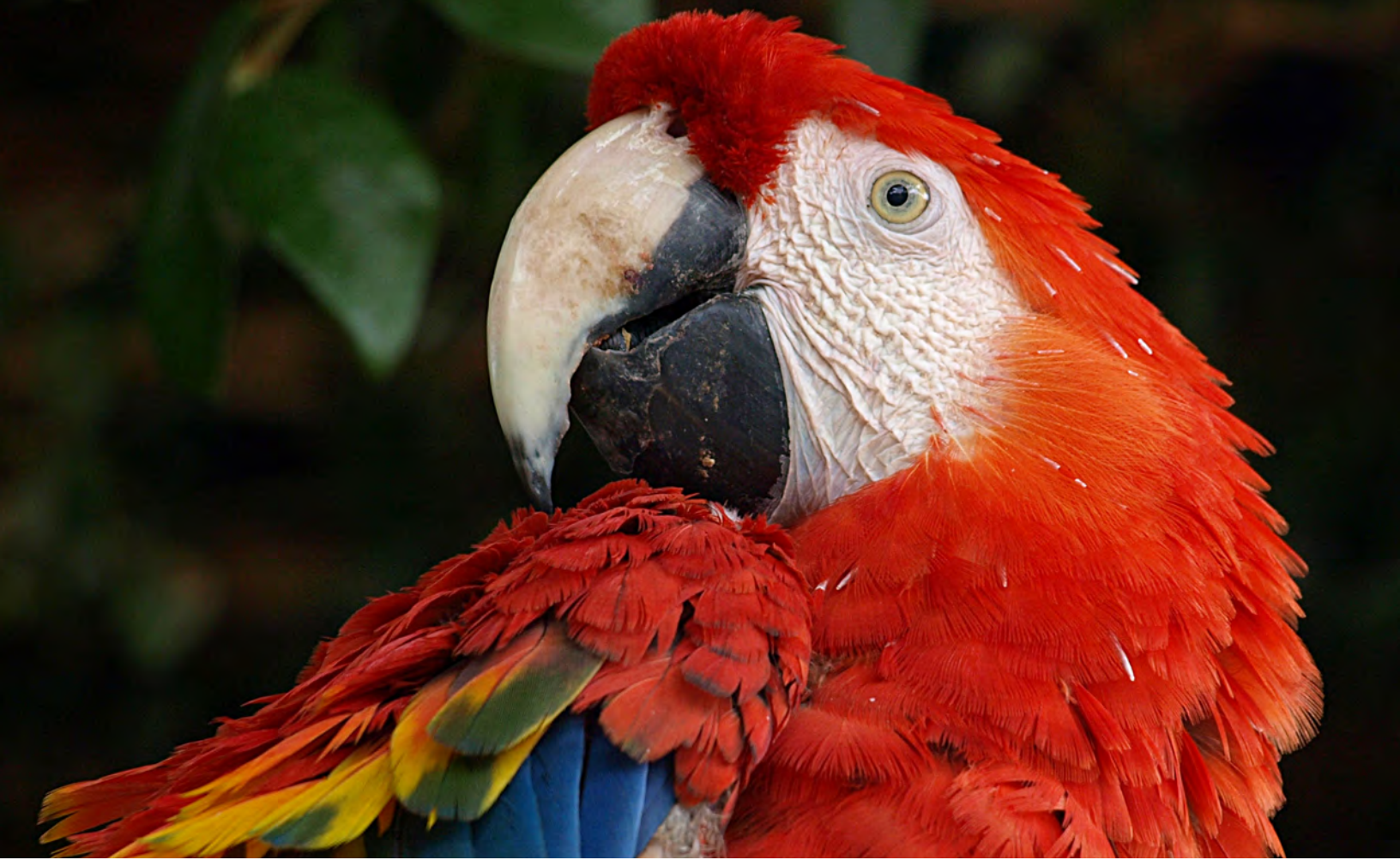
Scarlet macaw