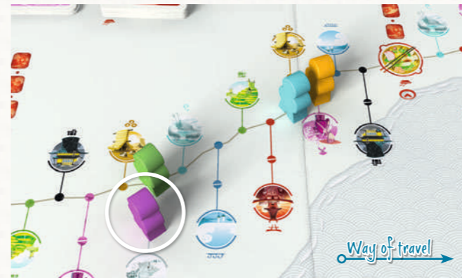
The Purple traveler is farther behind than the Green traveler, therefore he starts.