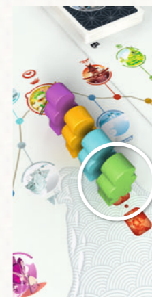
The green traveler will be the first one to leave the Inn.

The first traveler occupies the space nearest the road, and later travelers form a line after him.