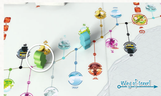
The Green traveler is farthest behind on the road, so he starts.

Sometimes the last Traveler may still be last after moving, in which case he goes again immediately.